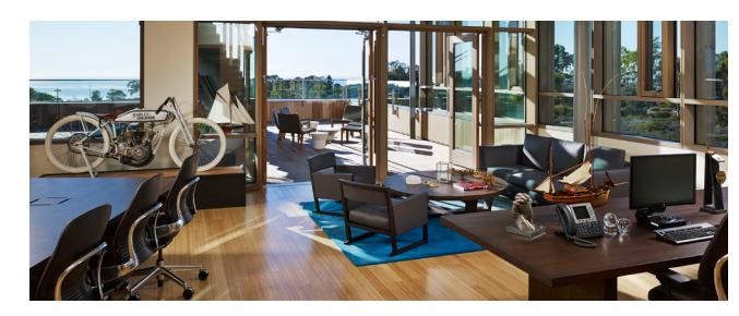
The chairman's suite is situated on the second floor, overlooking the terrace and garden and with inspiring ocean views. The space serves as the workspace for J. Craig Venter and is also used as a meeting room.